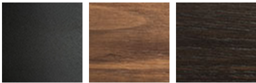
GF69 embossed graphite