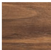
NC walnut canaletto