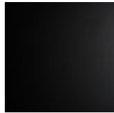
OP17 matt black