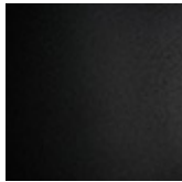
GFM73 black embossed