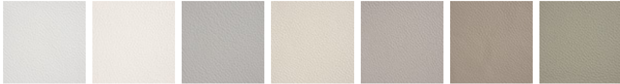
971 BIANCO 937 PALLADIO 972 CANOVA 947 OYSTER 959 ICE 939 NYMPH 949 CENERE