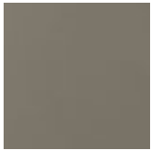
GF30 embossed grey