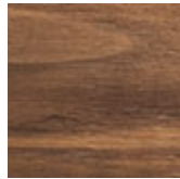
NC walnut canaletto