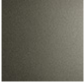
GFM11 titanium embossed