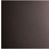
15 satin bronze