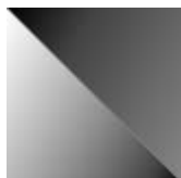
matt black aluminium