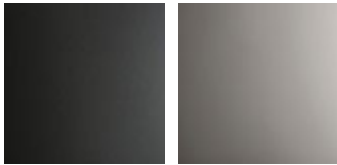
OP69 matt graphite