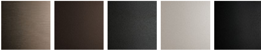
11 satin titanium